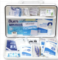
FIRST AID KITS