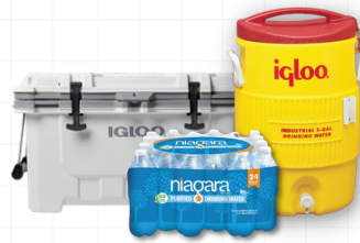
WATER & COOLERS